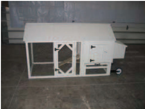
Your finished product!